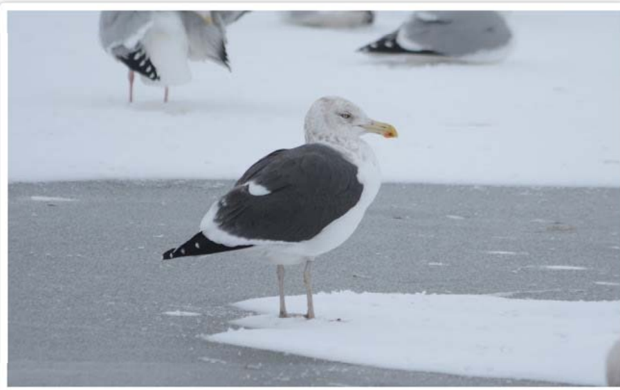
Chandeleur Gull (Kelp x Herring hybrid). 1st time observed in Illinois.

The putative Kelp x Herring hybrid is no other than "Gull Nasty", the Michigan City bird that has frequented the Indiana/Michigan lakefront for the last several winters.