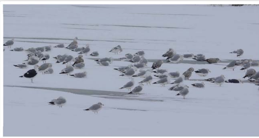
Chandeleur Gull (far left) & Slaty-backed Gull (far right at rest).