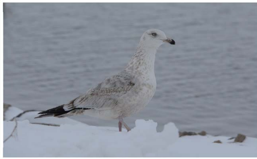
Extreme pale-end Herring Gull (2nd cycle).