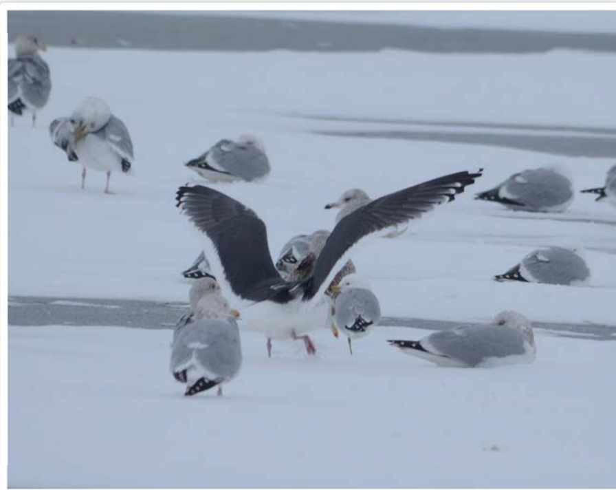
String-of-pearls on p6-p8. No mirror on p9.