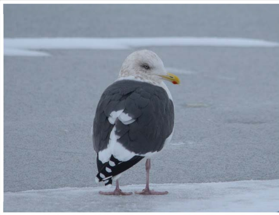
Slaty-backed Gull (adult). 1st Will County, Illinois record.

Also of interest is the continuing adult Slaty-backed Gull that seems to not like showing itself on weekends: