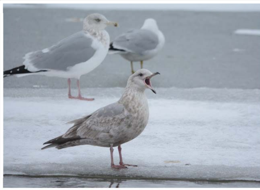
2nd Cycle Thayer's.